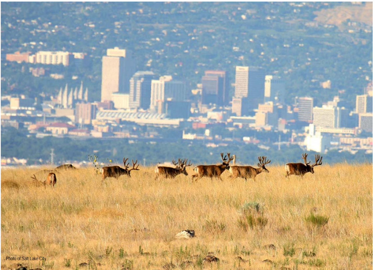
Photo of Salt Lake City