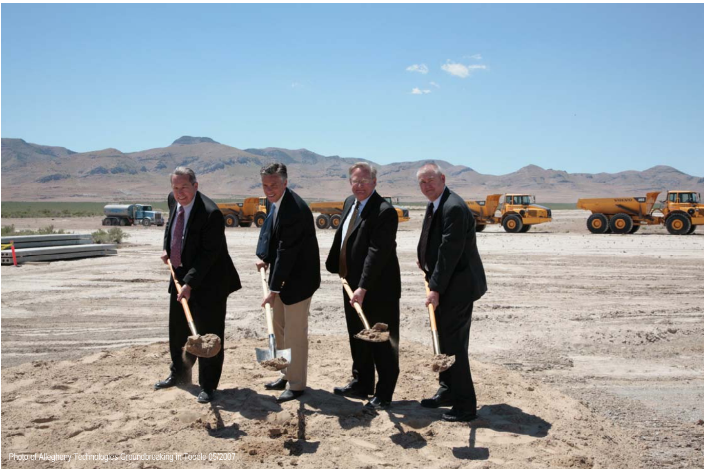
Photo of Allegheny Technologies Groundbreaking in Tooele 05/2007