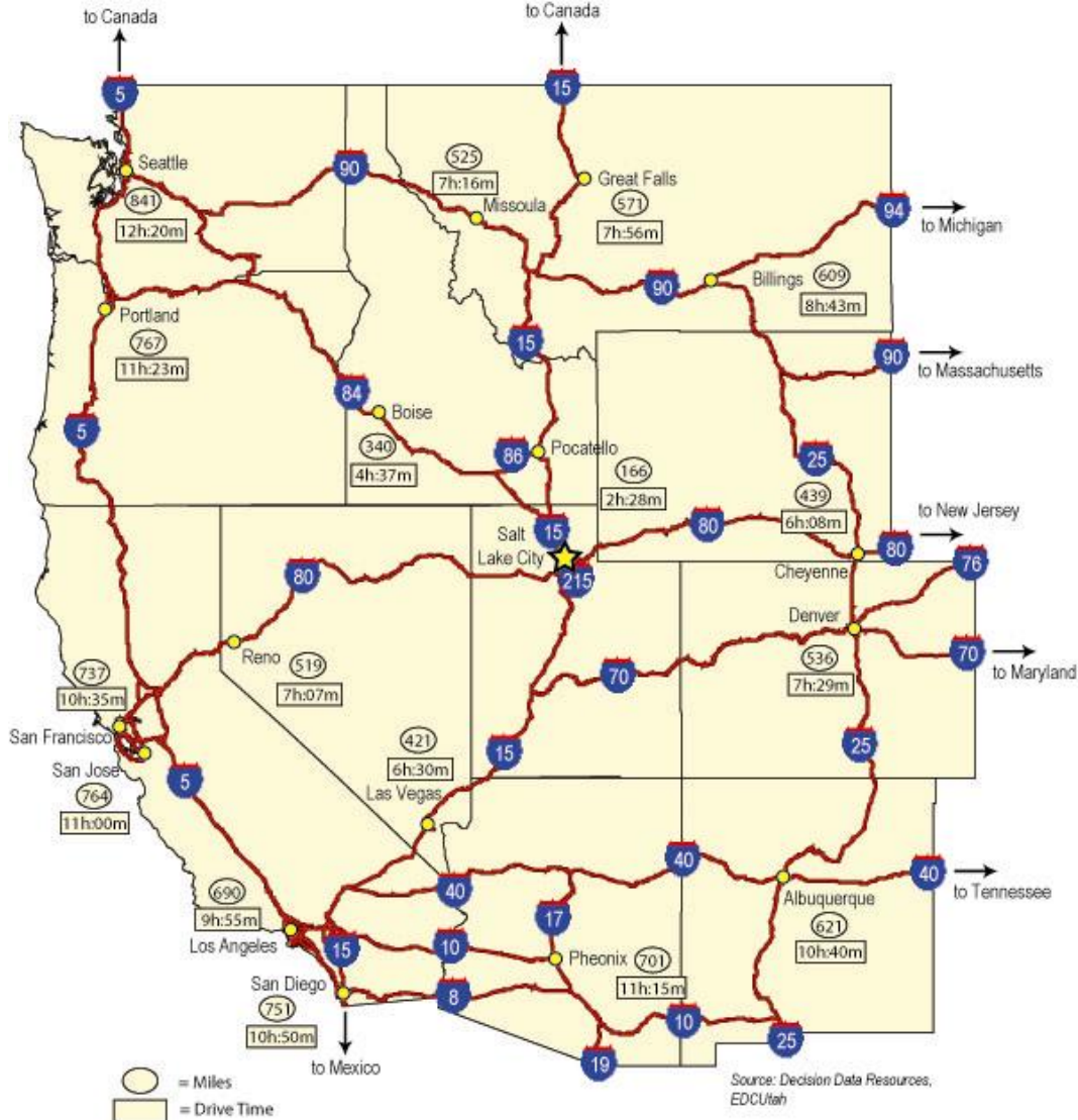
Distance and Travel Time to Western Cities

Utah plays a key part in the transfer of consumer goods and raw materials throughout the United States. Approximately 1,500 trucking companies have a presence in the state of Utah. Three major interstates (I-15, I-80 and I-70) connect in the state and access in all directions is readily available. Movement of consumer goods and raw materials is able to reach the west coast in a 1-day to 2-day delivery time. Movement of goods from the west coast to the east can be made in a 1-day day range from Utah to Denver and a 4-day range from Utah to Atlanta.