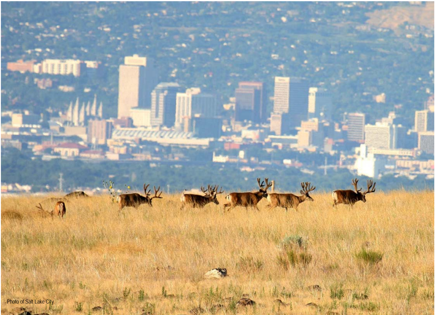
Photo of Salt Lake City